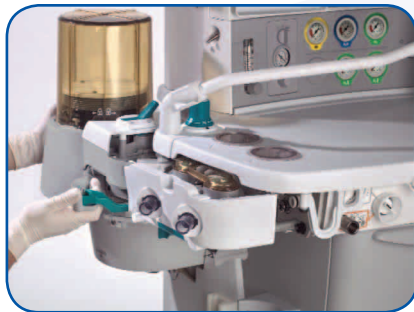
Easy on/off and no tools disassembly of breathing system facilitates easier cleaning and reduced maintenance time.